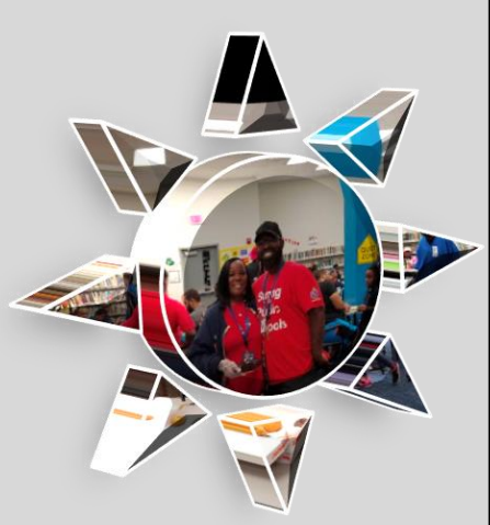
Father's Take Your Child to School day